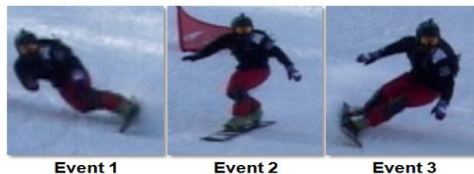
Figure 1. Classification of Movement in Different Events