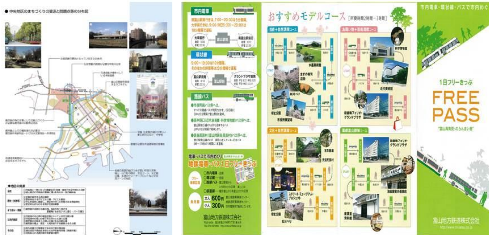
Figure 6. Kagochima-Chuo Station Transter system & Toyama City Tram Route