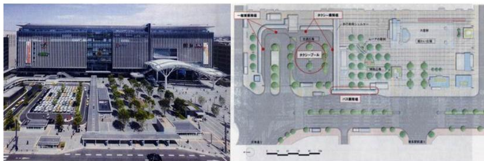
Figure 5. Hakata Station's Transfer Area View and Plan

Each railway stations plays the role of both the starting and ending point of various transportation means such as taxis, downtown area buses, ferries, subways and trams and connect the town.