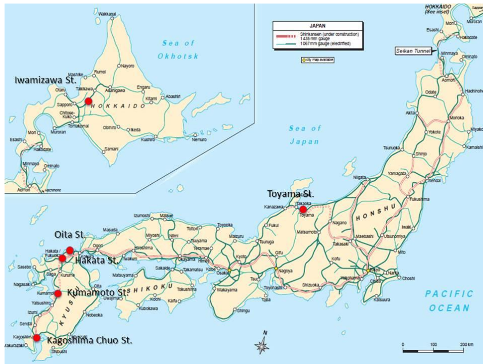
Figure 1. Map of the Study Object