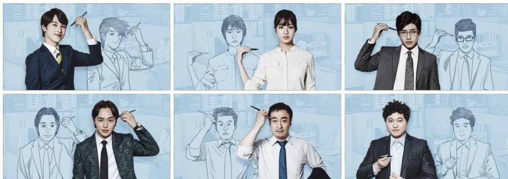
Figure 2. The Characters of "Misaeng"

As to the soap opera adaptation, "Misaeng", the actors and actresses did not match the original characters to the amazing level like "Secretly, Greatly" but 'senior manager Kim', who was the immediate superior of hero Jang Geu-rae, perfectly matched the original character and became the hot topic during the entire episodes of the drama.