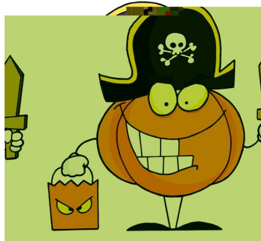
Figure 3b. Incorrect Repositioning of Blocks and Incorrect Tinge because of an Error