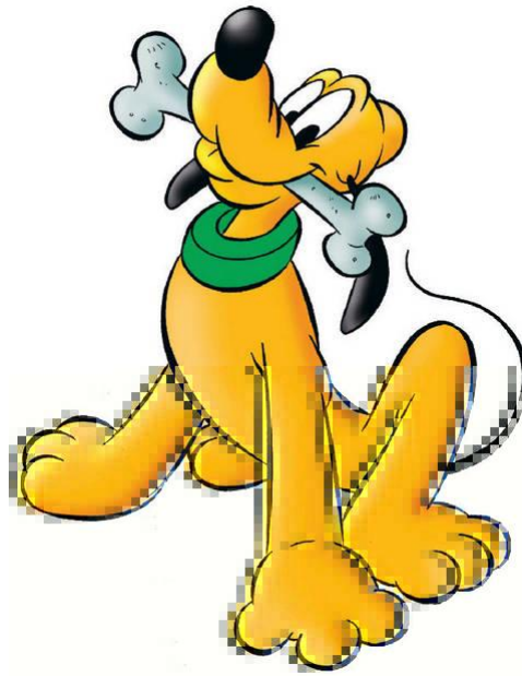
Figure 3b. An Image in Spectral Selection Mode with an Error in the DC Scan

When there is an error in Spectral Selection mode, one of the scans can be corrupted. If the DC scan is corrupted, the DC values from the error point can be incorrect, whereas the AC values remain unchanged. In such cases the DC values might be shifted to the left or the right and their color can be inaccurate, whereas the AC values will be correct and therefore the outline of the image will be as it should be.