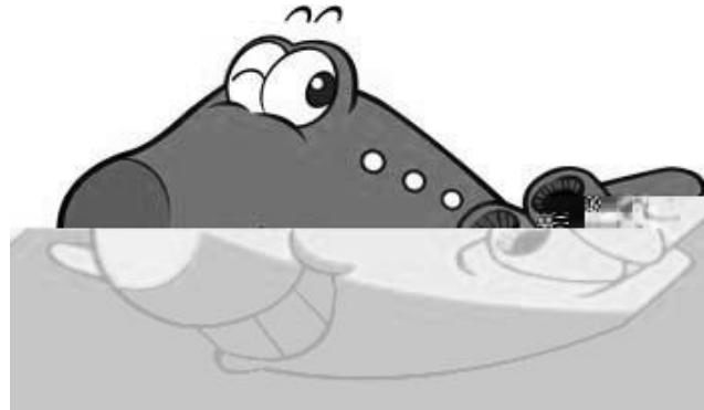
Figure 2b. Incorrect Placing of Blocks and Incorrect Tinge because of an Error

Another error that can happen is repositioning of the image portion below the error point from right to left or from left to the right e.g. the sword in Figure 3a was repositioned in the left side of the image in Figure 3b. In this image, several additional erroneous blocks have been added because of the error; therefore the blocks have been pushed to the right, but there has been no place for them in the end of the line. As a result they have been repositioned to the beginning of the next line i.e. the left side of the image.