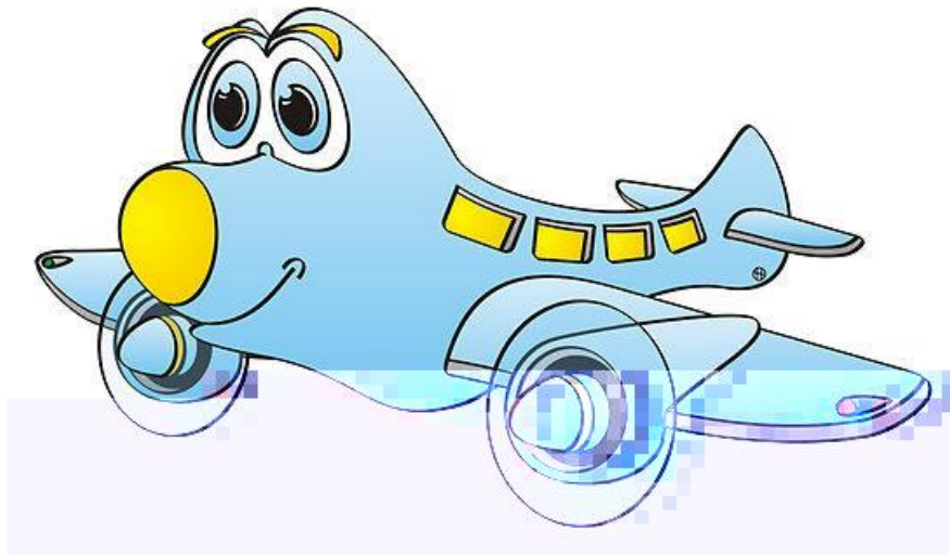
Figure 4b. An Image in Spectral Selection Mode with an Error in the DC Scan

Figure 3a and Figure 3b depict such a case. Figure 3a is the original image in Spectral Selection mode. In Figure 3b the same image has an error in the DC scan. This error caused a shift to the left of all the block colors in the lower part of the image. The AC values however, have not been shifted, so the outline of the image in the lower part of the image is correct.