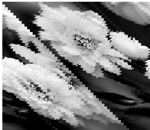
Figure 1b. JPEG File with an Incorrect X Value

Figure 2a and Figure 2b demonstrate these problems. Figure 2a contains the original correct image, whereas Figure 2b contains an image with an error. There was an additional block near the jet engines in this image. This additional block causes two problems: