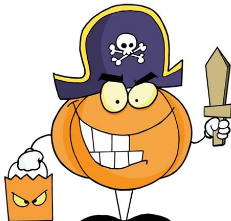
Figure 3a. Original Undamaged JPEG File

Another error that can happen is repositioning of the image portion below the error point from right to left or from left to the right e.g. the sword in Figure 3a was repositioned in the left side of the image in Figure 3b. In this image, several additional erroneous blocks have been added because of the error; therefore the blocks have been pushed to the right, but there has been no place for them in the end of the line. As a result they have been repositioned to the beginning of the next line i.e. the left side of the image.