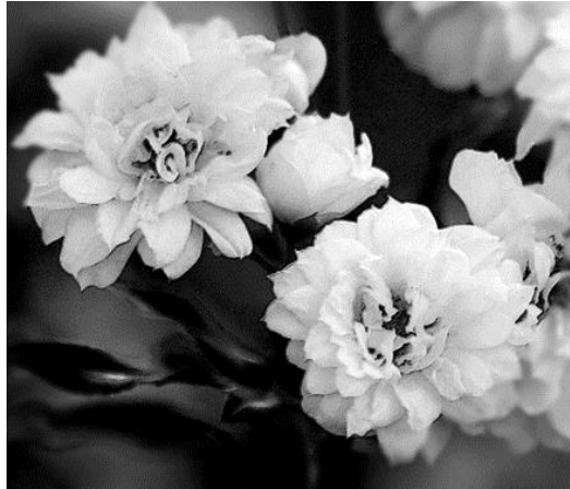
Figure 1a. Original Undamaged JPEG File

and the DC value of the previous block. A DC value can be incorrect as a result of an error. In such a case, the tinge of this block can be incorrect, but since the values of all the DCs are stored as differences, one wrong DC value will trigger incorrect DC values for all the rest of the blocks in the image.