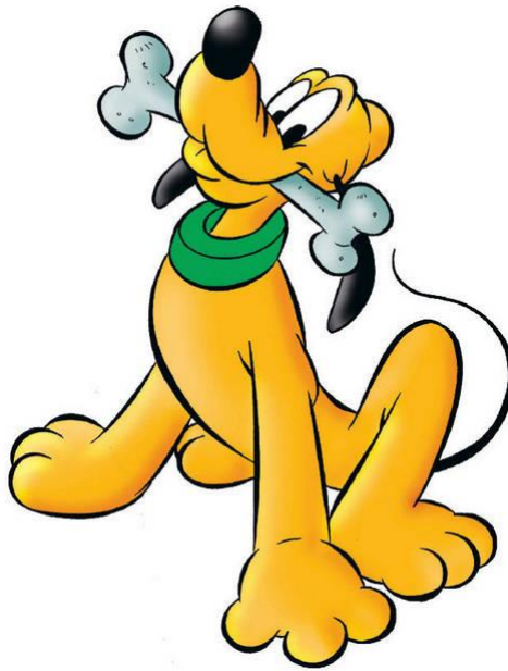
Figure 3a. Original Image in Spectral Selection Mode

The most common JPEG progressive mode is Spectral Selection. In Spectral Selection mode, in the beginning, the DC values are sent. Subsequently, the AC values are sent according to their frequencies. The low frequency AC values are sent first followed by the high frequency AC values. When just DC values are arrived, each 8x8 block will be filled with equal pixels and the image will be "pixilated". When more and more AC values arrive, the image will become clearer.