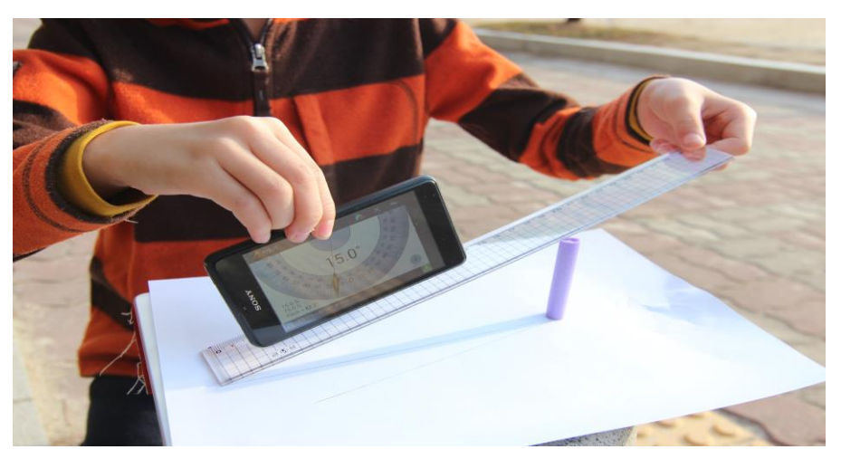
Figure 1. An Example of Method to Find Meridian Transit Altitude Using a Smartphone Application

Also, Figure 1 is an example of method to find meridian transit altitude from a smartphone application. Especially, teaching spatial sensibility requires the use and understanding of materials because teaching astronomy requires the use of models [6].