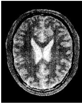
Figure 1: Floating Image