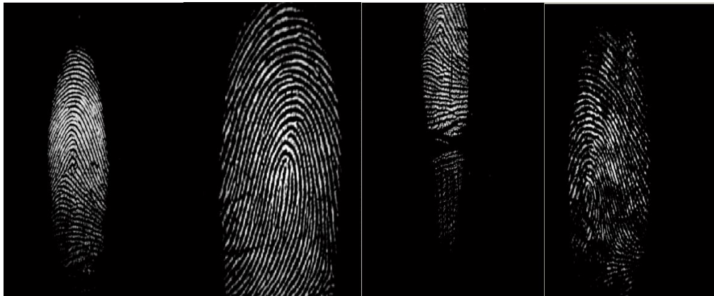
Figure 1. Fingerprint Images before Iterative Fast Fourier Enhancement

We have considered Fingerprint Verification Competition (FVC 2006) as a database for our work. This is an online database and consists of four datasets, i.e. , Database1, Database2, Database3 and Database4. These sets are prepared with the help of different sensors. This database consists of 1800 fingerprint images those have been used in this research. In FVC2006, data collection is done with introducing difficulties as wet/dry impressions, rotated fingerprint, light/dark fingerprint impression, etc.