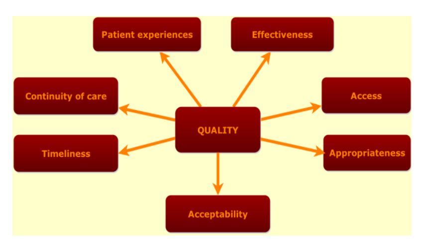
Figure 1. Aspects of Quality

Prevention. It provides full health care for patients, better functionality of complex requirements providing effective and comfortable decisions, where quality and safety of medical services must remain at the highest level. Considering the need for improving the quality of the new generation of health care systems, we want to help in the process of improving the effectiveness, timeliness, safety and overall quality of medical services of this healthcare system. Aspects of quality are showed in Figure 1.