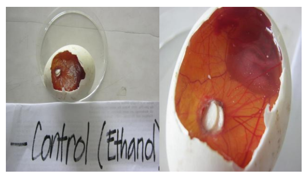
Figure 2e. CAM in the Negative Control