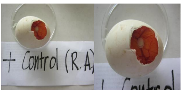
Figure 2f. CAM in the Positive Control