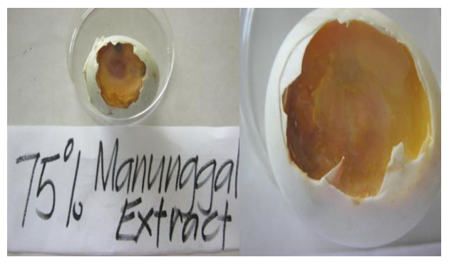
Figure 2b. CAM 75% Manunggal Extract