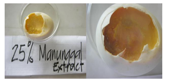
Figure 2d. CAM in 25% Manunggal extract

International Journal of Bio-Science and Bio-Technology Vol. 4, No. 2, June, 2012