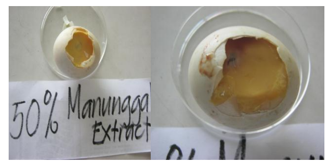
Figure 2c. CAM in 50% Manunggal Extract