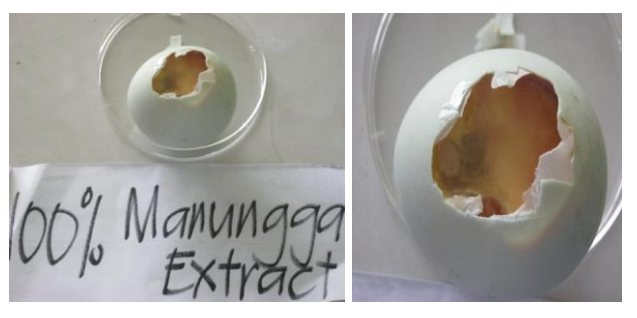
Figure 2a.CAM in100% Manunggal Extract