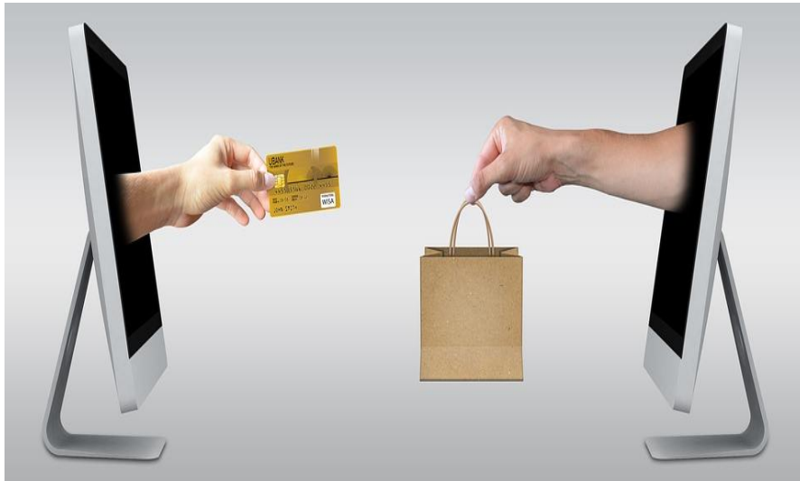
Figure 7. Ecommerce application example using AI Techniques [3]

big companies are investing huge amounts for getting good set of profits. Now a day, this ecommerce business is increasing in such a way, that the growth was very high and good. Some of the good applications or the companies where this ecommerce business was growing very fast was the Amazon, flipkart etc. This two ecommerce companies are occupying the most of the business through online in recent days. The data was collected from the users by registering their data, their hobbies, their birthdays and other days and it will be stored in their databases. The likes of the customers and the items which they had purchased earlier and list of items which they previously verified or visited will be given the high priority and it will be stored. Whenever, there is a slight change or slight changes in the prices of such articles, the immediate message will be generated to the customers for their information. In the customer is interested, he can go through the website and can book or order the item.