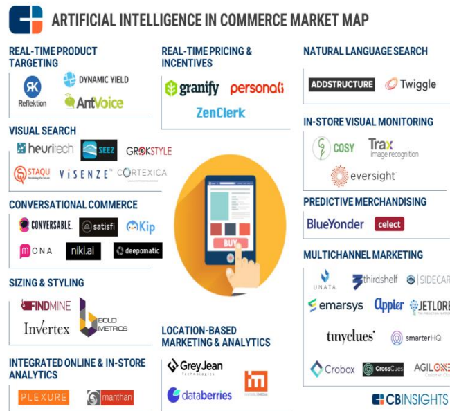
Figure 3. Ecommerce applications using AI [1]

The implementation and utility of AI and its related techniques and other algorithms had increased a lot for getting better outputs and better businesses for the ecommerce companies and websites. Now days, the ecommerce applications and business websites had increased a lot such that the big companies around the worked are trying to enter in to this business and investing more and more. With this technology, the customers are getting the facilities and sources in such a way to their door to door delivery and choosing the things from the home. These companies and websites are providing the customers with good offers and discounts such that to attract the more number of customers from time to time.