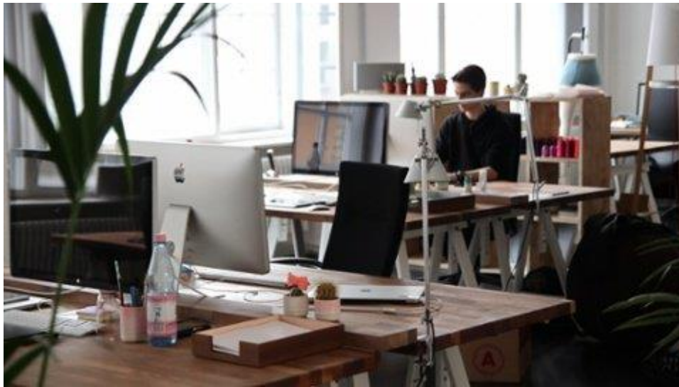
Figure 4. An example of workplace implementation of AI techniques [1][3]

in detail in the current sections. In the present days, the business applications and their communication is full of applying the content with news applications, channels for both news and entertainment, tools for online software's and other online applications for financial and other applications, and also to observe the working nature of the employees in a industry. The utilization of AI and its technique sin the business applications such that the business will be increased in a good manner. Allowing the people in the business will get good amount of profits and that will lead to the employees for getting good hikes and other benefits too. As a result, the companies and industries can concentrate on their performance in terms of productivity and focus on the productivity such that either to enhance or to decrease the productivity of the organization.