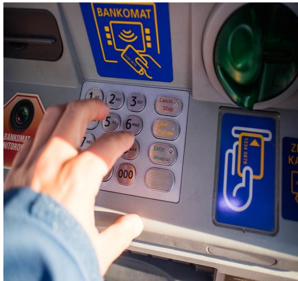
Figure 6. Banking applications example using AI [3]

Now days, all the banks in the world wide are trying to adapt the Artificial Intelligence and its related techniques and other algorithms. All the banks are trying to adapt these techniques due to the facilities and the provisions these algorithms and other techniques are providing for the development of banks. These methods had created a great impact on the banking and other related sectors for further increasing of the banks and their businesses. The banks are looking for the automation of the banking processes and other banking related all types of transactions. By the implementation of these transactions, the maintenance costs of the banks and other costs were becoming reduced day to day and the banks are increasing their profits day by day. Hence, all the banks are trying to reduce the capital amount on the investment on various sectors or various applications and tasks in the nationalized and international banks.