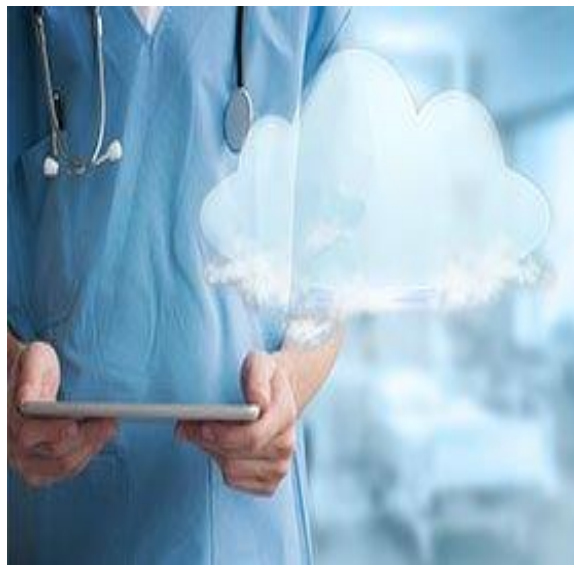
Figure 5. Healthcare application example of AI [1]

Now a days, almost all the hospitals and the medical laboratories are maintaining the full database of the patients who were coming for the hospitals for the treatment and other related issues. This stored data will be useful to the patients in the future purposes for their visits and also t identify the development in the health of the patient with the previous visit of the patient to the hospital to the current visit of the patient to the same hospital. At the same time, the doctors also will have the clear picture of the patient's condition with the previous visit with the current visit. Also the doctors can have the clear picture of the problems to be faced in the coming future with the current state of the problems with the patient.