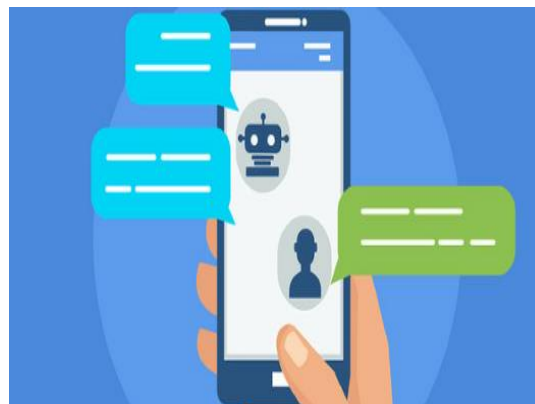
Figure 2. Chatbots example of AI applications [1]

The usage of current technology applications and other algorithms was increasing and it is used in almost all the smart phones releasing now a days. The usage had increased a lot for various applications in the smartphones too. It is also started using in other areas like healthcare, gaming etc. The chatting applications and other people discussing applications with the help of smartphones with internet facility had increased a lot. The processing of such applications and other related issues can be resolved by using some good algorithms such that o store such data and processing of such data was required. The processing includes storing of data, retrieving of data and finding the similar type of words which were typed by the users previously in the previous chats.