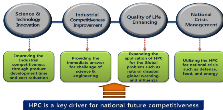
Figure 3. Application of HPC

The government may provide necessary support for the industries' activities of the national high performance computing research and development to stimulate and the industrialization of the results of the research and development. The government should preferentially promote support for technology-integrated medium and small firms related to high performance computing and venture enterprises using new technologies.