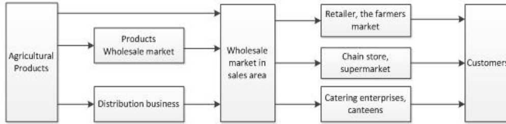
Figure 1. Agricultural Products Distribution Network in Traditional SC Chain