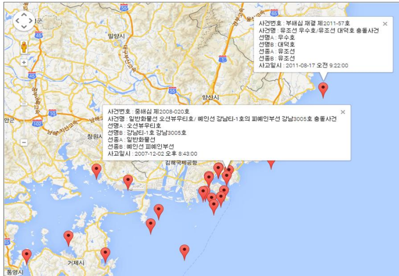
Figure 4. A Result of Web-based Implementation